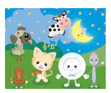
Hey Diddle Diddle