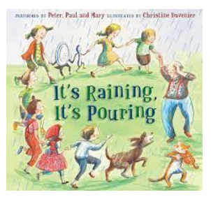
It's Raining, It's Pouring