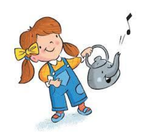
Polly Put the Kettle On