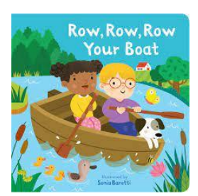
Row, Row, Row Your Boat