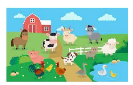
Old McDonald Had A Farm