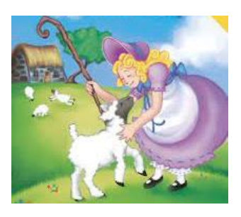
Little Bo Peep