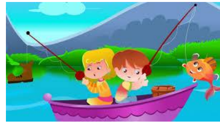
1, 2, 3, 4, 5