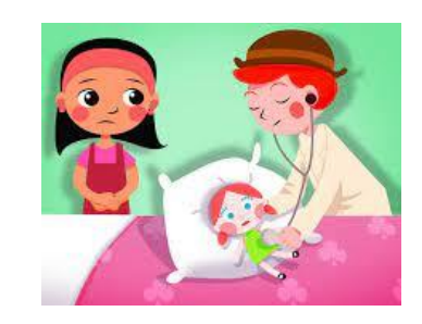
Miss Polly Had a Dolly