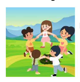
Here We Go Round the Mulberry Bush

'If a child knows 8 nursery rhymes by heart by the time they are 4 years old, they are usually among the best readers and spellers in their class by the time they are 8"