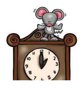
Hickory Dickory Dock