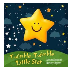
Twinkle Twinkle Little Star