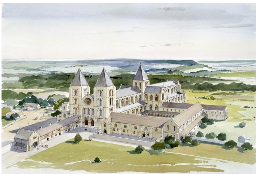
An artist's impression of Guisborough Priory as it would have looked. St Nicholas' Church is on the left hand side, showing how large the priory would have been.

Our topics this term will be based on our local area. In addition to the work we will be doing linked to our Whitby trip we are going to be doing lots of work based on Guisborough Priory and its importance to our town. In the second half of the term we will be visiting the priory to carry out some fieldwork. In science we will be undertaking work on Sound and the life cycles of plants. Our P.E. lessons will hopefully all be taken outside in the summer term, concentrating on athletics and orienteering. Our artwork this term will be based around Celtic knot work. In ICT we will be doing some work on data handling and Internet Safety. We will be singing a variety of songs throughout the term and will be using songs to develop our knowledge of French vocabulary as well as developing our musicality.